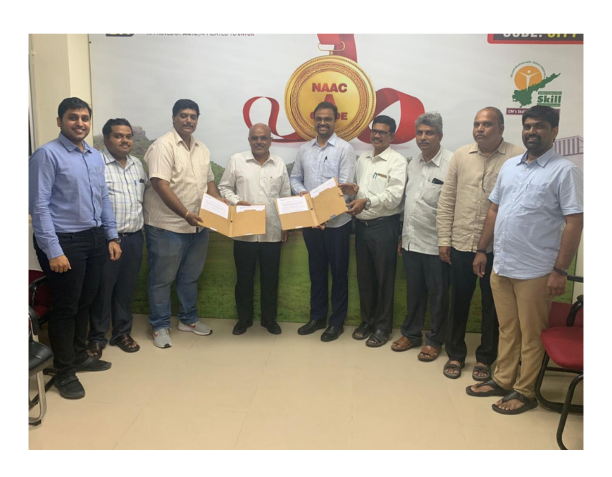
COLLABORATION OF MOU WITH EDU SKILLS