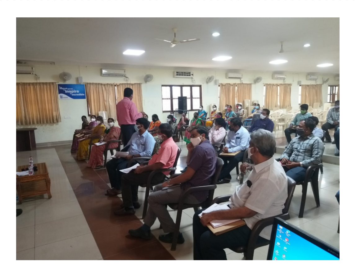
FACULTY DEVELOPMENT PROGRAM